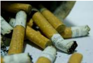
Bachmont, Wikimedia Commons