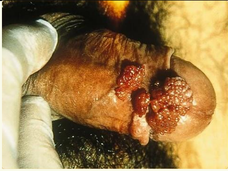
SOA Amsterdam